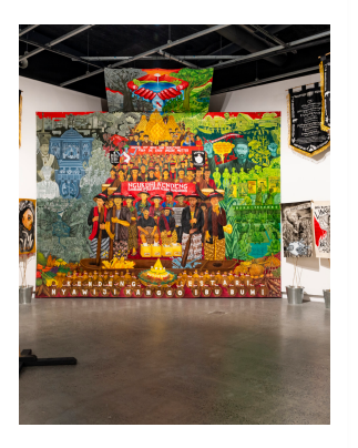
Media + The Arts