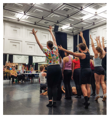
Media + The Arts